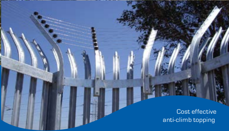
Cost effective anti-climb topping