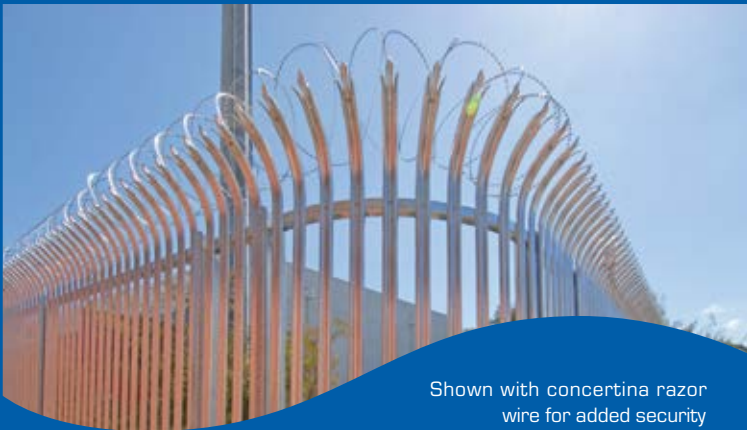
Shown with concertina razor wire for added security