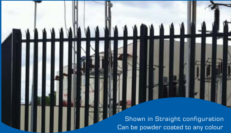
Shown in Straight configuration Can be powder coated to any colour