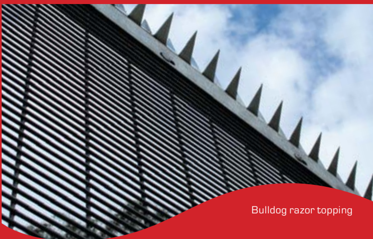
Bulldog razor topping