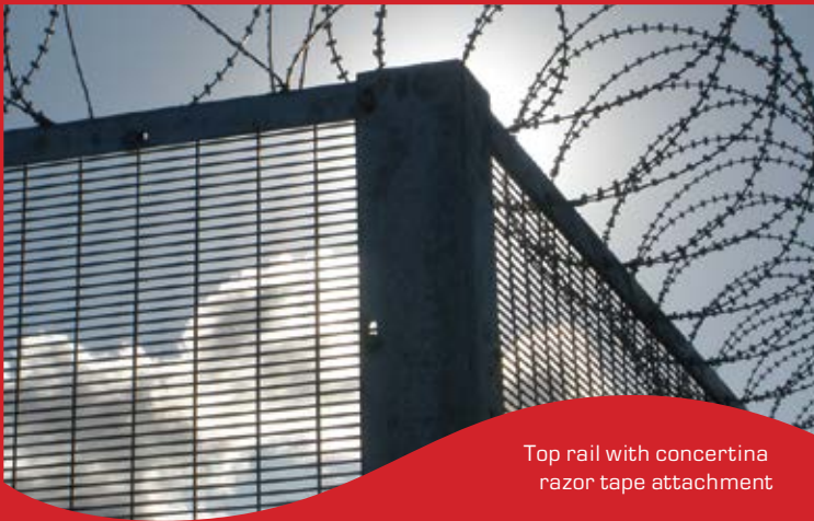
Top rail with concertina razor tape attachment