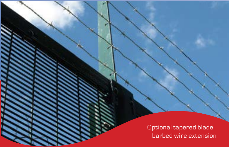
Optional tapered blade barbed wire extension