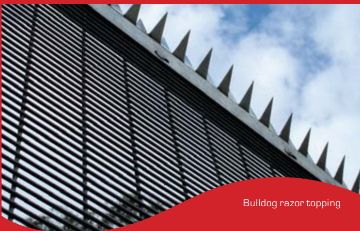
Bulldog razor topping