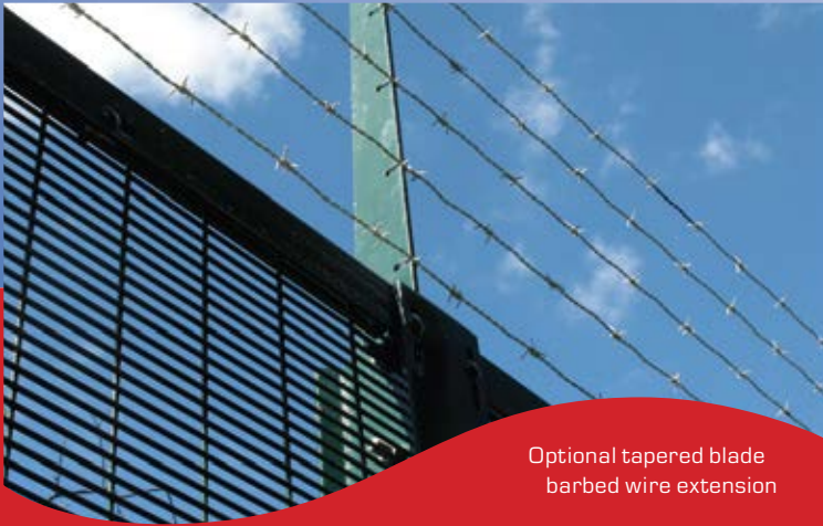
Optional tapered blade barbed wire extension