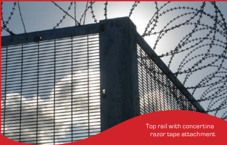
Top rail with concertina razor tape attachment