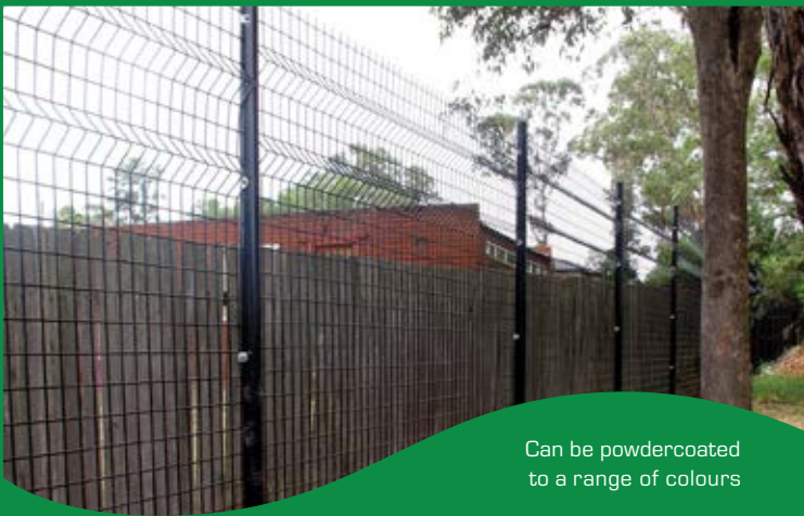
Can be powdercoated to a range of colours