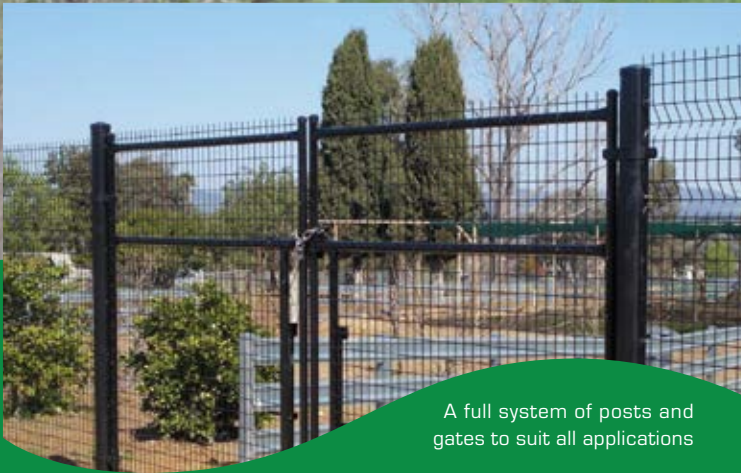
A full system of posts and gates to suit all applications