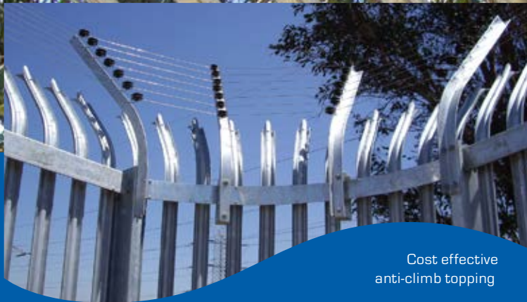
Cost effective anti-climb topping