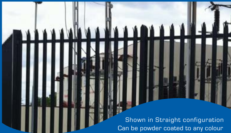
Shown in Straight configuration Can be powder coated to any colour