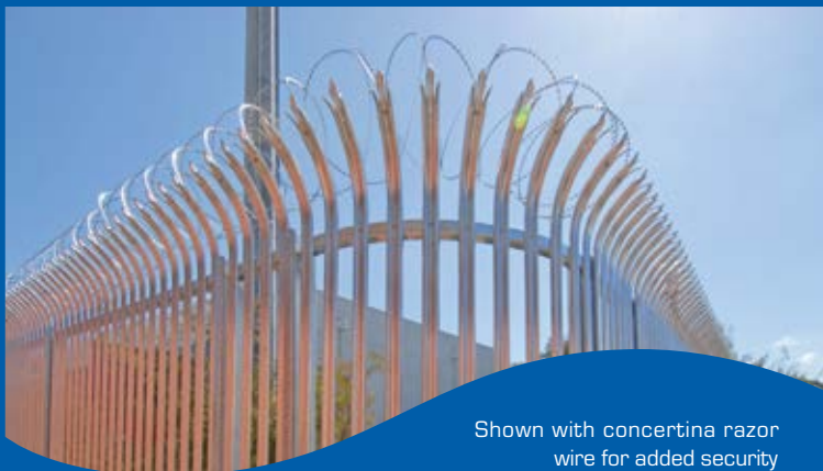
Shown with concertina razor wire for added security